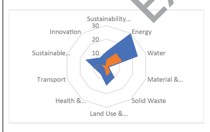
Figure 3 Building Planning and Design Standard Criteria and Achievement