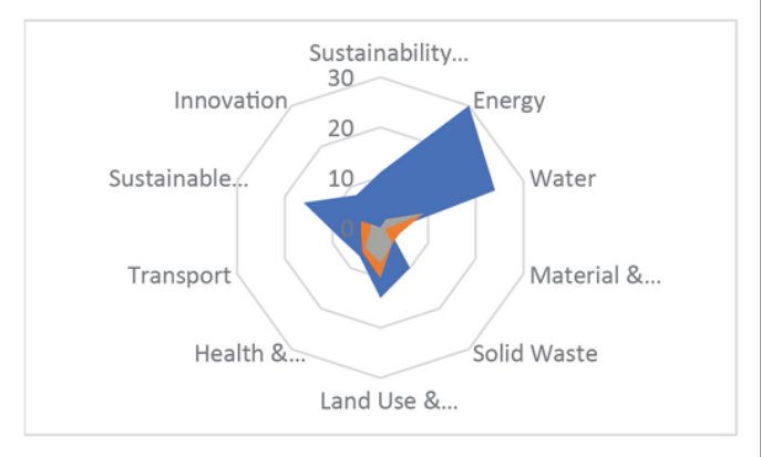
Figure 2 - Green Building Project Sector Criteria and Achievement

The above is a snapshot of the "as-designed" performance of the Example Development Name development against the EarthCheck Building Planning and Design Standard and the Green Building Sector Project Criteria required by Example Bond Name. Upon completion of construction and through the assets life the development is required to continue with a credible evidence-based sustainability assessment and certification program such as the EarthCheck Company Standard. More information explaining this report and further requirements of this program are detailed on following pages.